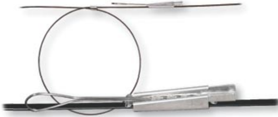
Diamond/Sachs drop wire clamp (aluminum 1-2 pair, serrated shim)